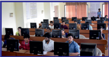
R & D Lab