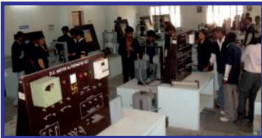
Electrical Machines Lab