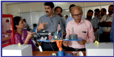
Dynamics of Machines Lab

MVSR provides best facilities with state-of-the-art laboratories